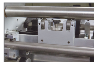
CAM Actuated Compression Crease

The COUNT™ AccuCreaser Air provides fast, consistent quality creasing and perforating with a variety of features that make it top of its class. Get super accurate CAM actuated compression creasing with rotary perf/score capabilities, including micro-perf (up to four at a time), and automated distance recognition to support auto set-ups for a variety of creases, even perfect bind set-up. The AccuCreaser Air utilizes a bottom vacuum paper feed with a built-in register guide to ensure accuracy with every sheet.